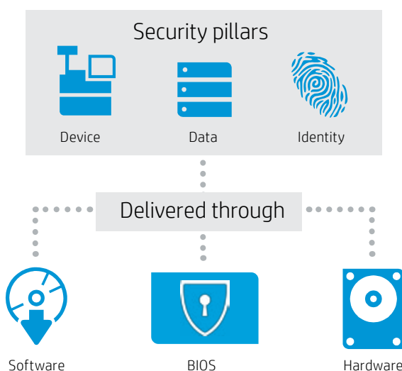
Figure 1. HP Client Security delivers end-to-end protection at all levels of the business IT environment.

Our client security strategy includes creating multiple layers of protection across devices, data, and identity. Along with delivering HP security tools through software, we provide additional features in hardware and embed strong protections all the way down to the BIOS level. IT managers can centrally configure, deploy, and update these tools without interrupting employee productivity.